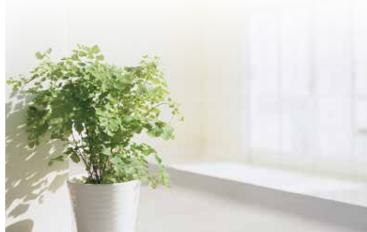
Brain Health Assessment

如家族有中風病史，宜盡早識別本身的中風風險，並作針對性預防，以避免因中風所致的不可逆轉的傷害。